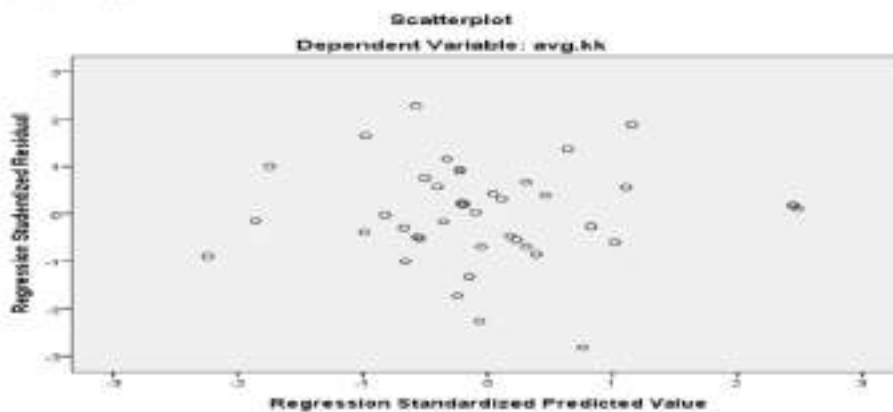
Figure 3. Heteroscedasticity Test